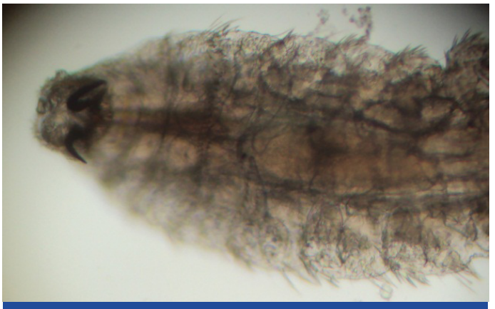
[Table/Fig-3]: Anterior end of first instar larva (L<sub>1</sub>) of Oestrus ovis (x100)