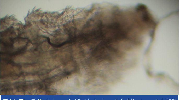
[Table/Fig-4]: Posterior end of first instar larva (L,) of Oestrus ovis (x100)

Following the removal of all the larvae, the symptoms completely resolved within a few hours. In the patients who had remained without treatment for some time, the swelling of the eye had increased rapidly, and this prevented the eye opening.